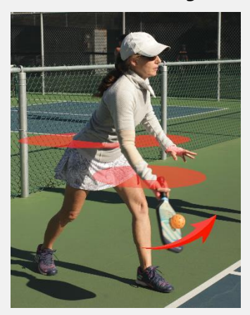
Figure 4-3 (legal serve)