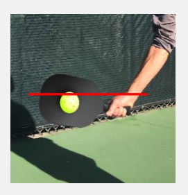
Figure 4-2 (illegal serve)