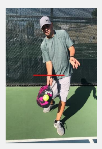
Figure 4-1 (legal serve)